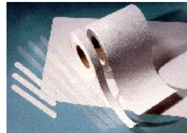
Shown: Strips, Rolls, & Mat

Unfortunately, most injuries caused from slips and falls occur in wet slippery areas. Serious injuries result in painful medical problems which could lead to financial loss, legal entanglements, long term disabilities, and insurance difficulties. Flex Track® 4100 was designed to help prevent slips and falls in those potentially slippery wet places.