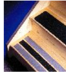
Shown: 2" Rolls & 6" x 24" Die Cut

Safety Track® Resilient is a softer, lighter version of our original Safety Track® 3100 and 3200 Coarse. Because it's made of a softer material, it's comfortable enough for bare foot traffic, yet tough enough to withstand heavy boot, shoe, or cart traffic. Engineered as a premier performer, 3500 Resilient is a perfect solution for helping to prevent slips and falls on most industrial and commercial applications.