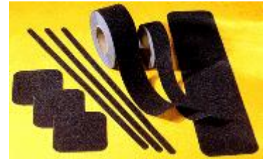
Shown: Die cuts, Strips, & Rolls

The number of serious injuries caused from slipping and falling in the workplace is startling. Serious injuries result in painful medical problems which could lead to financial loss, legal entanglements, long-term disabilities, and insurance difficulties. In addition, OSHA has established strict guidelines requiring non-slip protection on hazardous surfaces. Safety Track® 3100 was engineered to help prevent slips and falls in potentially slippery places. Safety Track® 3100 has provided over twenty years of industry leadership.